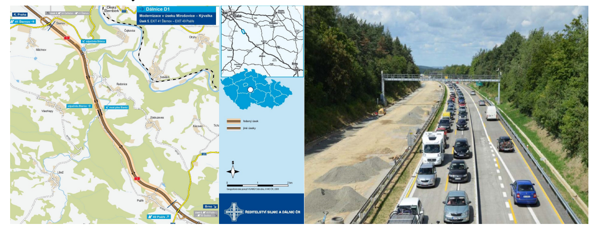
Fig. 1. Location of estimated reconstruction project and 2 + 2 traffic lane arrangement during work

As mentioned above, for the purpose of this research an extensive set of unique data from already completed reconstruction project ("Section 05" at kilometres 41-49 of the backbone Czech highway D1, see Fig. 1 below) was gathered. These data were not only of a generally available kind, e.g. on air pollution in the monitored area or statistics of the Czech or European Statistical Office, but in particular project documentation, technical report and traffic engineering measures of the project, which are essential for the user costs' estimation. Due to the large volume of data and performed calculations, this paper does not provide its full extent, but outlines the method and lists the summarized results only.